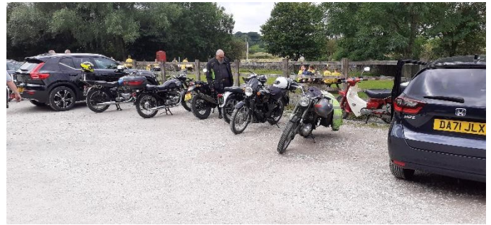
Bikes from both sections at Hulme End.