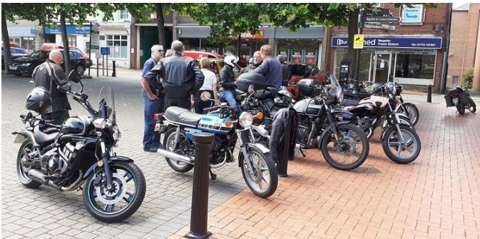
Meeting up in Ripley.

This ride attracted sixteen riders and a couple of passengers. There was a broad mix of bikes and, it turned out, roads.