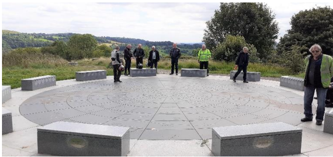
The Stardisc at Wirksworth.

Having whinged about me possibly leading through a ford on the last one, the second lane we took led us through, of course, a ford. In Wirksworth, we took a detour to visit the Stardisc.