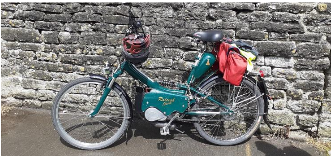
Seen at Monyash. A 1964 Raleigh Ultramatic moped special to which the owner added front and rear suspension and replaced the single speed engine with a two-speeder.

Off we went, past Alport Heights, through Wirksworth, Middleton, Hopton, Longcliffe, Elton and Youlgrave to Monyash, arriving just as it started to rain. As we ate lunch, the rain became torrential.