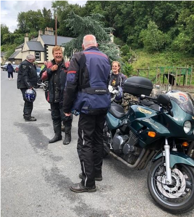
The finish at Bonsall.